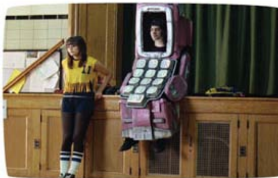
▲ A series of new PSAs help teens recognize digital dating abuse.

component, television, radio, print, outdoor and Web ads and is designed to help teens recognize digital dating abuse and provide them with the tools to initiate a conversation about this form of abuse. The PSAs direct audiences to visit, www.ThatsNotCool.com , where teens can find tools to "draw their own digital line" and a forum to discuss this form of abuse and seek help.