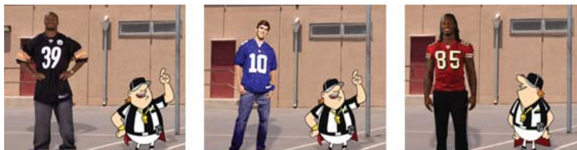
▲ Pittsburgh Steelers' Willie Parker, San Francisco 49ers' Vernon Davis and New York Giants' Eli Manning encourage children to get up and play an hour a day!

The Ad Council and the U.S. Department of Health & Human Services joined with the National Football League (NFL) to produce a series of localized PSAs as an extension of their national Childhood Obesity