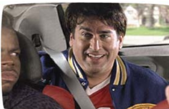
▲ Actor/comedian Rob Riggle urges teens to speak up against reckless driving in a humorous new TV spot.

For more than two decades, car crashes have been the number one killer of teens in the U.S., according to the National Highway Traffic Safety Administration. In an effort to reduce reckless driving fatalities among teens, the Ad Council joined with a coalition of state Attorneys General and consumer protection agencies to launch a new series of PSAs in February. The ads target teens and young adults and urge them to speak up when they are in the car with friends who are driving recklessly.